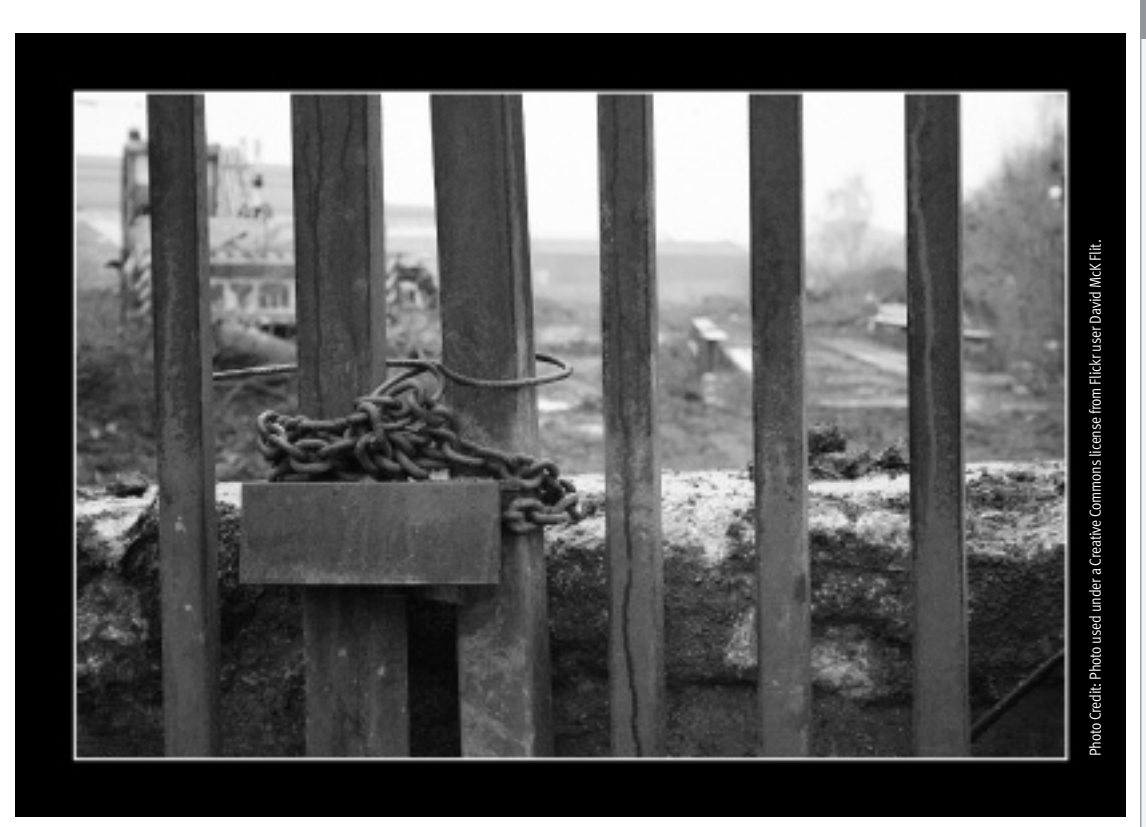
Philips' New Jersey plant is the fifth facility in the U.S. to be shut down since 2008.

he doors were shuttered at the Stonco Lighting factory in Union, N.J., May 6 as the plant's parent corporation, Netherlands-based Philips Electronics, moved ahead with plans to outsource the work to its operations in Mexico, eliminating more than 60 manufacturing jobs.