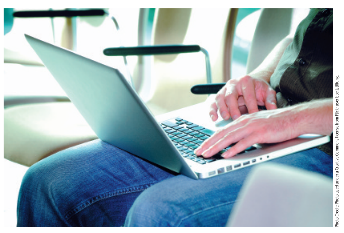
New information tools Project Tracker and OARS will boost local unions' efforts to organize and build market share.