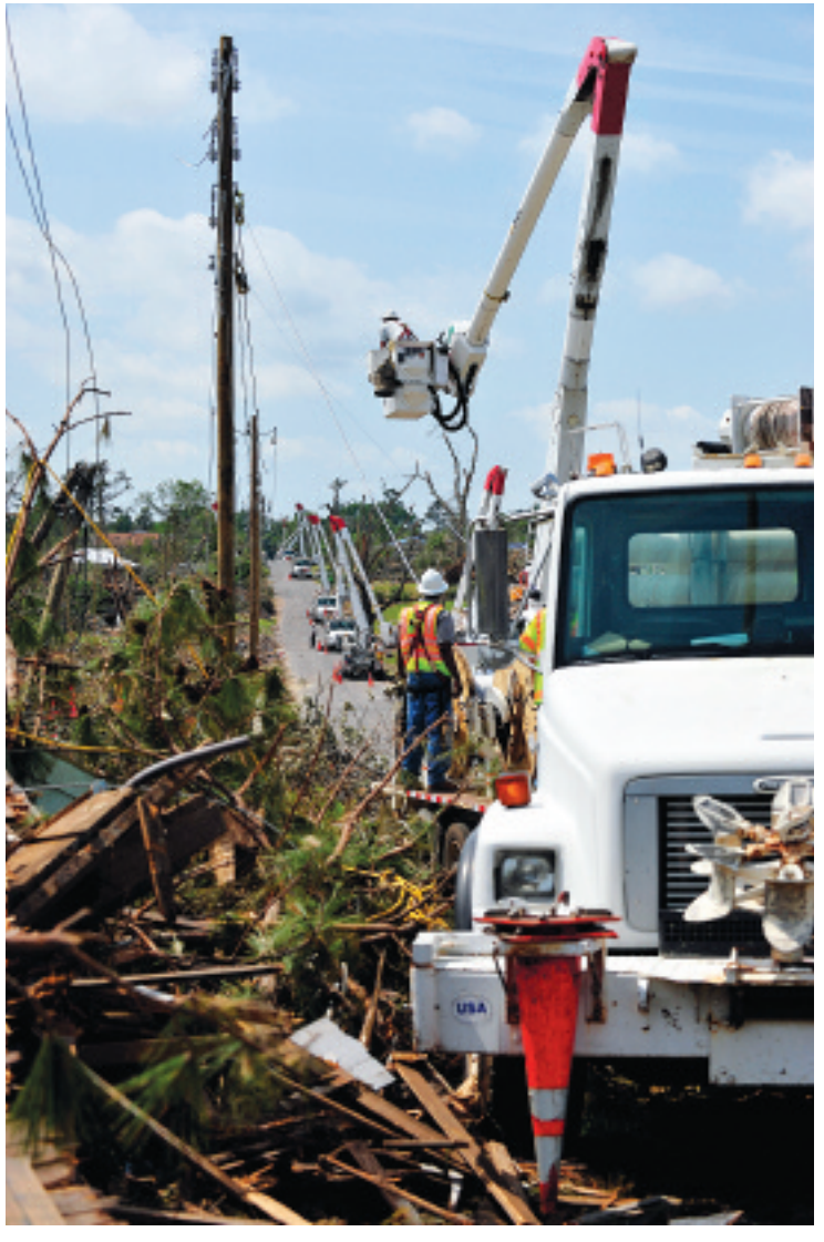
Despite the massive scope of the damage, the IBEW and Alabama Power were able to restore power to most customers in only five days.

International Brotherhood of Electrical Workers