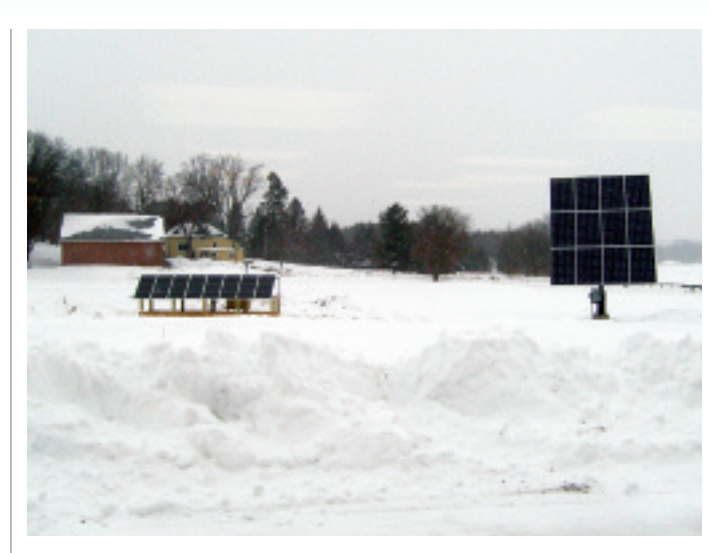
Local 14 installed solar arrays at the union hall.

Local 8 members are enjoying various summer activities. Local golf and softball leagues are in