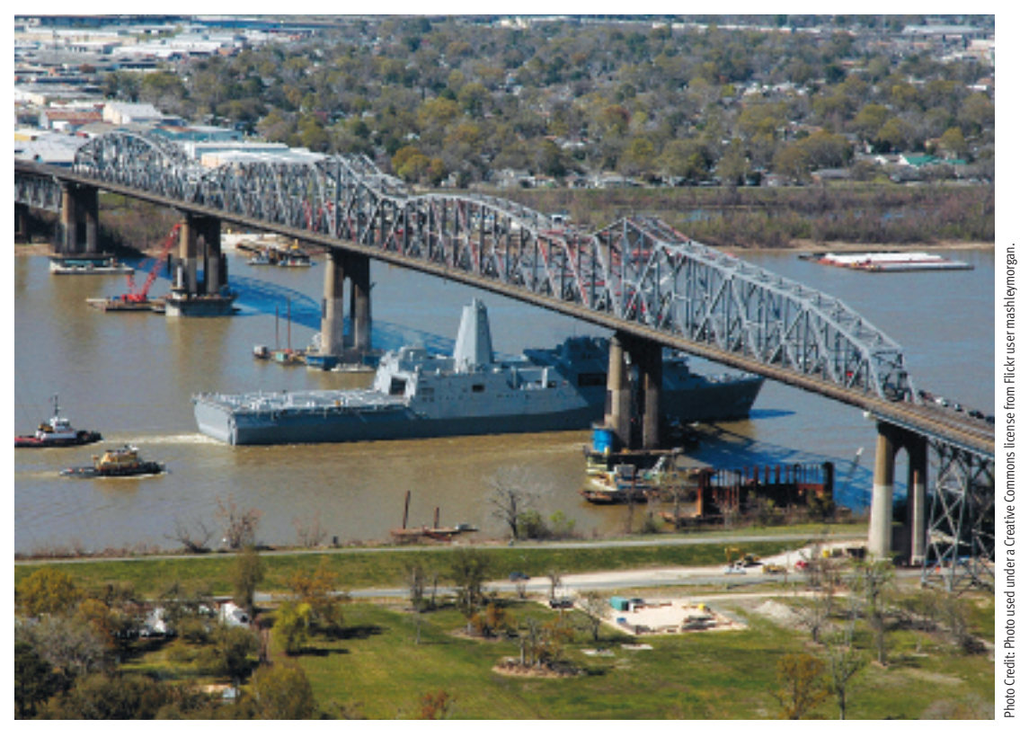
The USS New Orleans leaves the Avondale Shipyard in 2007.

"We will fly by our own steering, not by an outside corporate entity," Couch says.