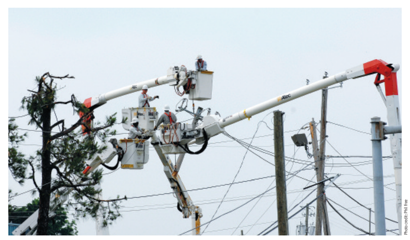
Thousands of IBEW members from 17 states helped restore power to Alabama.

labama was ground zero for April's disastrous twisters, where more than 230 people died. Nearly half a million residents were left without power, making the state's 3,000 IBEW utility members a key component in its recovery.